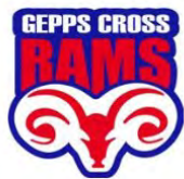
Gepps Cross CC