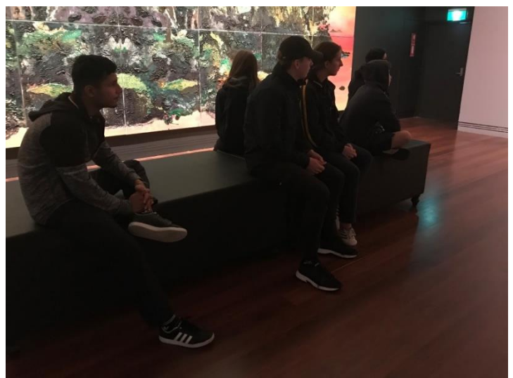
Year 10 Art excursion to see the Ben Quilty exhibition at the Art Gallery of SA.