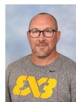
Brendan Mann Basketball Academy

I would also like to acknowledge all the participating schools and staff for their positive attitude that contributed to a very successful for day for all involved. Well done everyone!