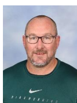
Brendan Mann Basketball Academy

The carnival is supported by Maxima. Maxima staff will be present during the carnival to assist in the 'break out room' and available to provide information and support to young people with a disability to successfully transition students through and from school, into further education or employment.