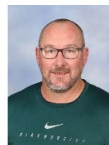
Brendan Mann Basketball Academy