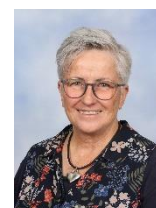
Wendy House Principal

I wish you all safe and refreshing holidays.