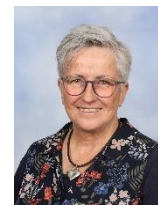
Wendy House Principal