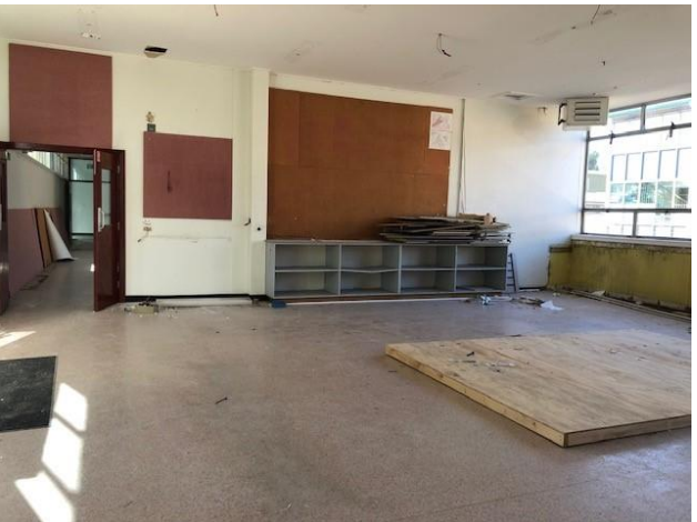
Art block emptied