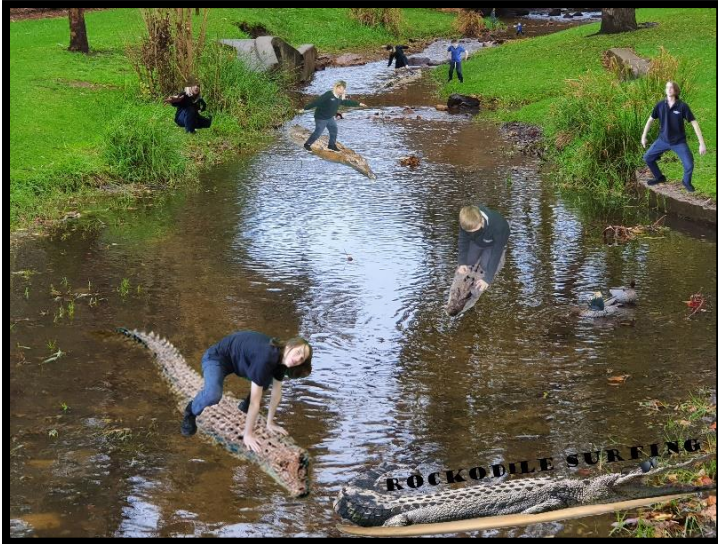
Crocodile Surfing – Arren Year 10