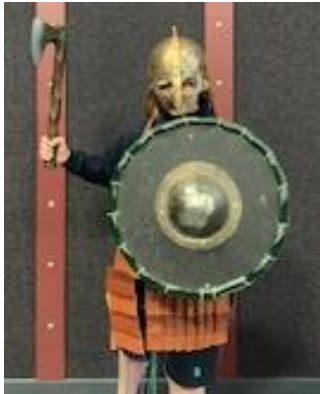
Caelen dressed as a Viking