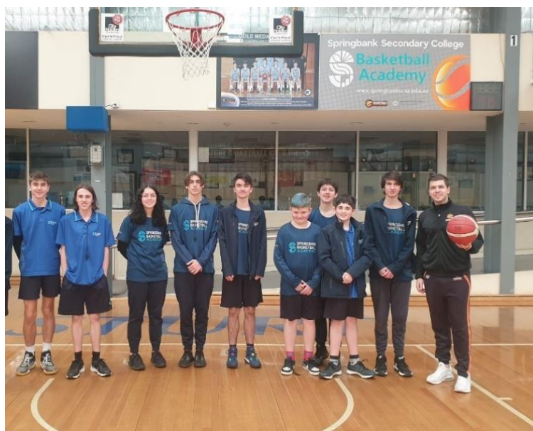
Brendan Mann Basketball Academy

Thank you again to the students for their efforts! Well done.