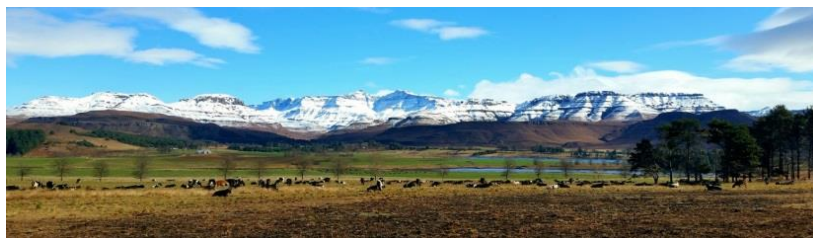
Mountains in Lesotho under snow. Rudi Botha. Used with permission.